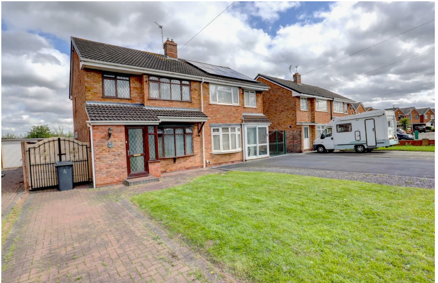
Malvern Avenue, Nuneaton